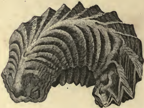
MYTILUS, Crista Galli.